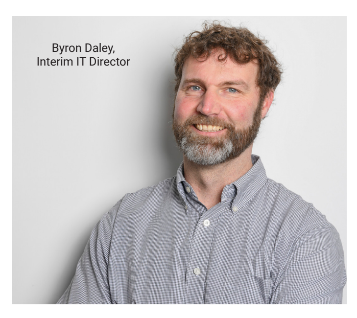
"(npServ) are quick to respond and keep things running smoothly. They have been helpful with troubleshooting."

68 nonprofit IT clients 3 new IT clients